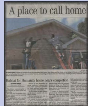
2007- A community effort to support two BVI clients