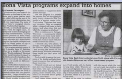
1994- Early childhood intervention programs begin visits in homes