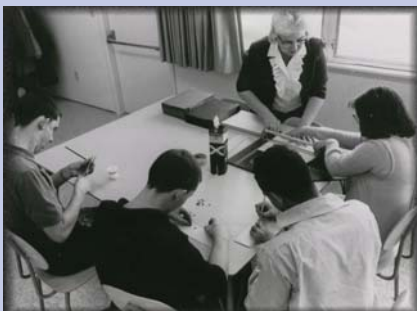
1967- Students participate in class

1958- The Bona Vista School for children with disabilities begins in September at 317 W. Walnut Street in Kokomo.