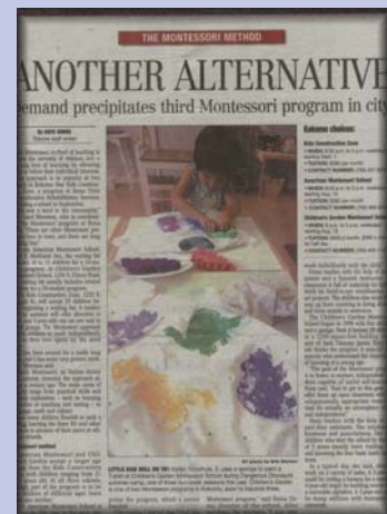
2003-Montessori begins at Bona Vista Programs