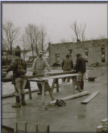
1992- Bona Vista expands their Laguna St. facility