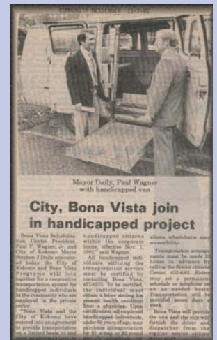
1982- Transportation program benefits local individuals