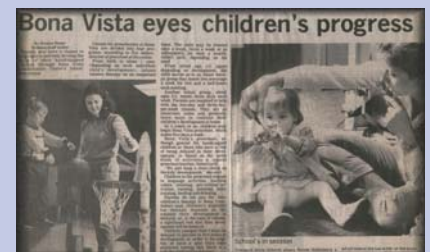
1987- Intervention program begins