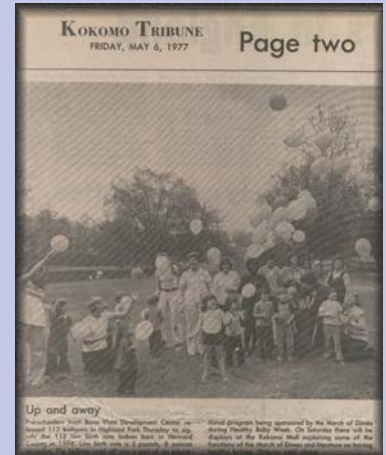
1977- Preschool children enjoy a balloon lift

1987- Bona Vista begins a homebound intervention program for infants and toddlers. Homebound parent adviser services are also offered.