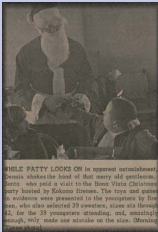
1964- Christmas party with firefighters