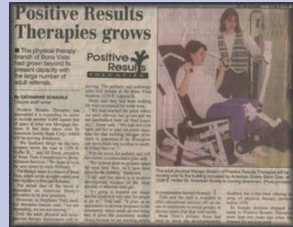
1998- Therapy services expand in Kokomo

2007- Bona Vista, RACI and Habitat for Humanity join together to build a new home for a couple, who are BVI clients.